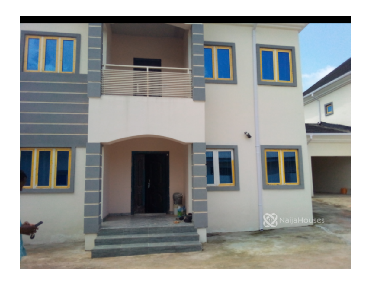
Wuse 2, Abuja, Abuja FCT NGN 5,000,000.00