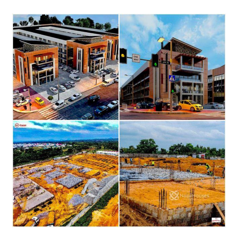
Sector center G, by Kabusa garden , Abuja, Abuja FCT NGN 6,257,500.00

Rehoboth Realty Lekki Phase 1, Lekki, Lagos Nigeria