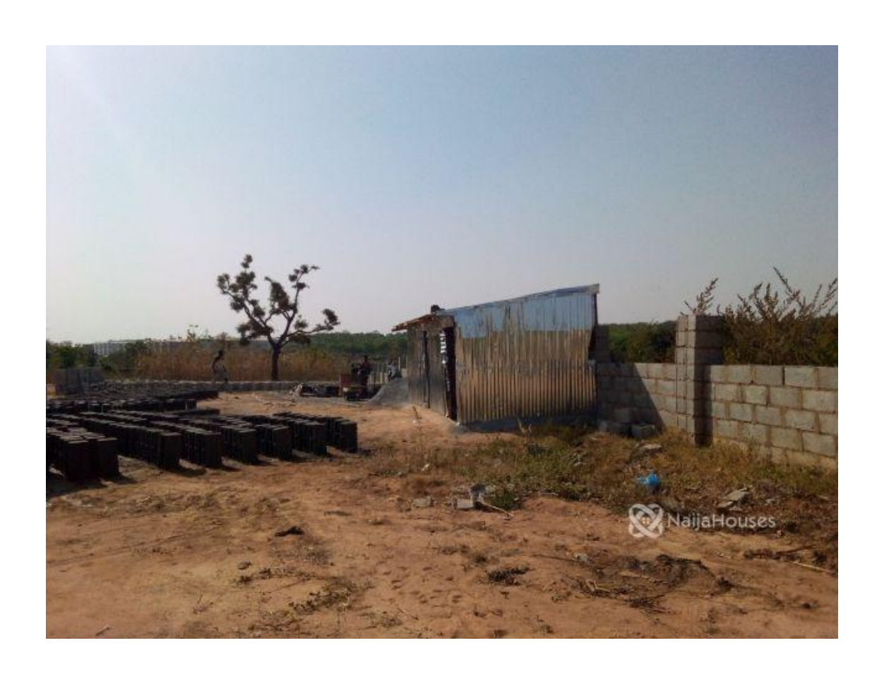
Next Cash and Carry, Abuja, Abuja FCT NGN 150,000,000.00