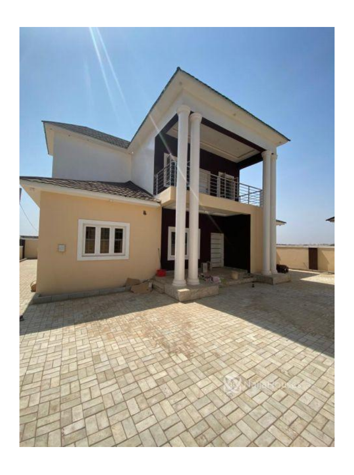
Lokogoma district, Abuja, Abuja FCT NGN 90,000,000.00