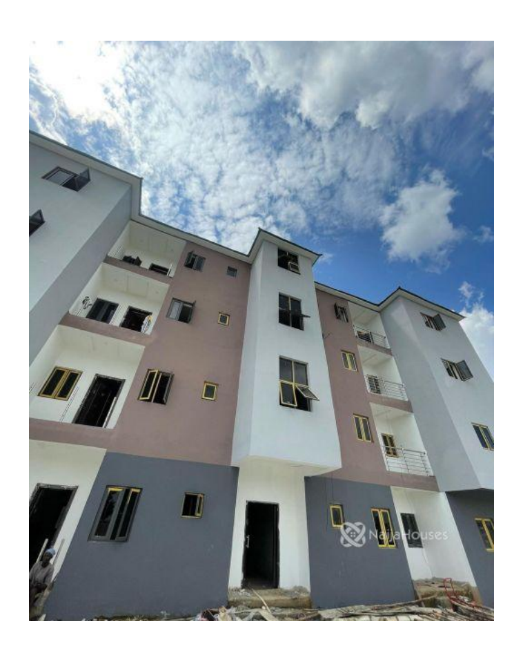
lifecamp, Abuja, Abuja FCT NGN 30,000,000.00