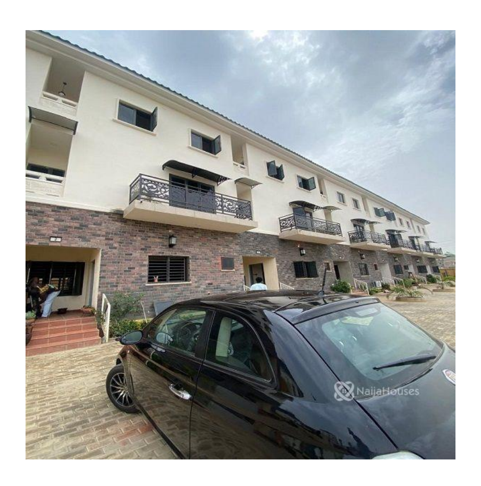
Jahi district, Abuja, Abuja FCT NGN 10,000,000.00