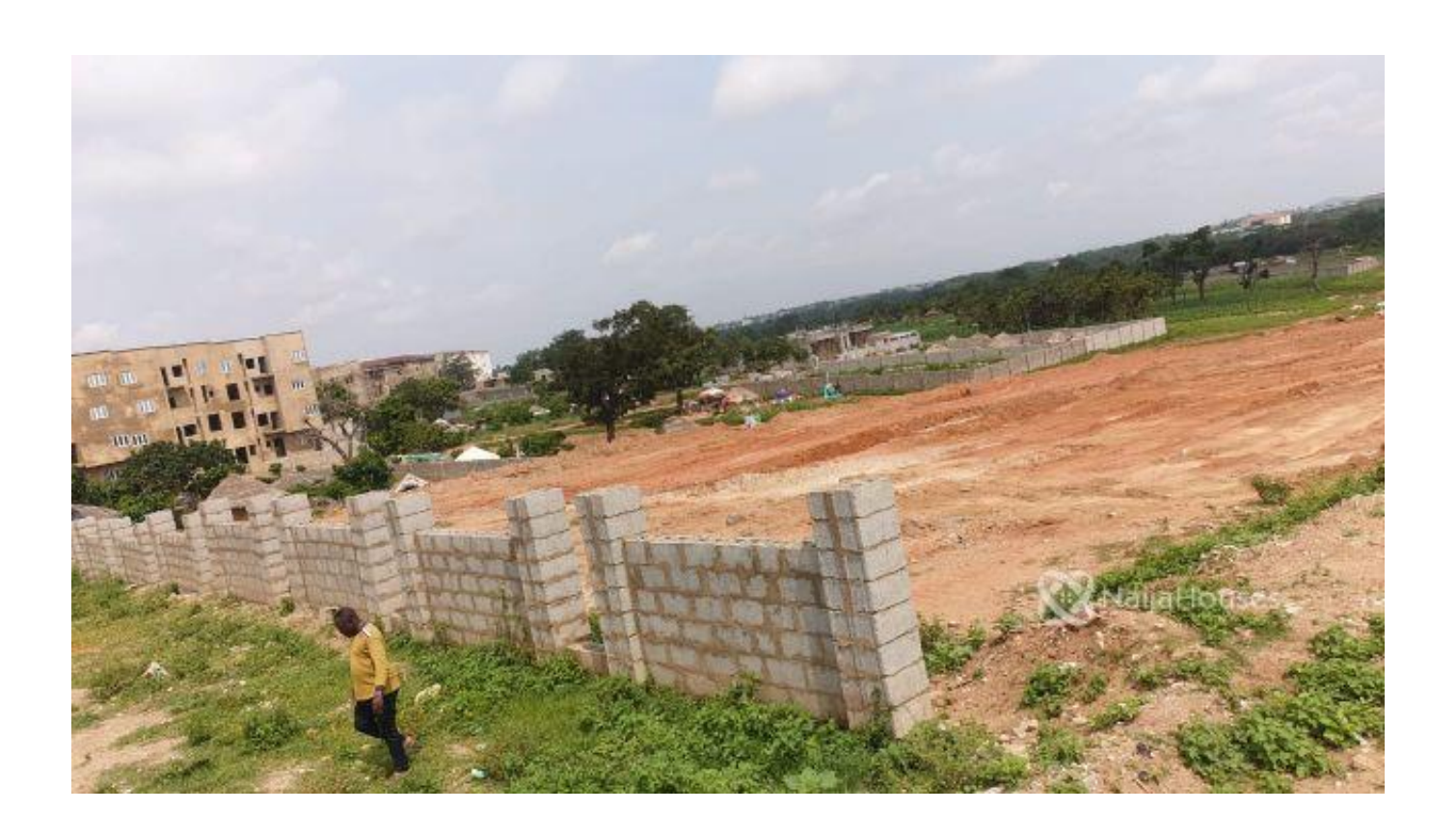
Jahi District, Abuja, Abuja FCT NGN 180,000,000.00