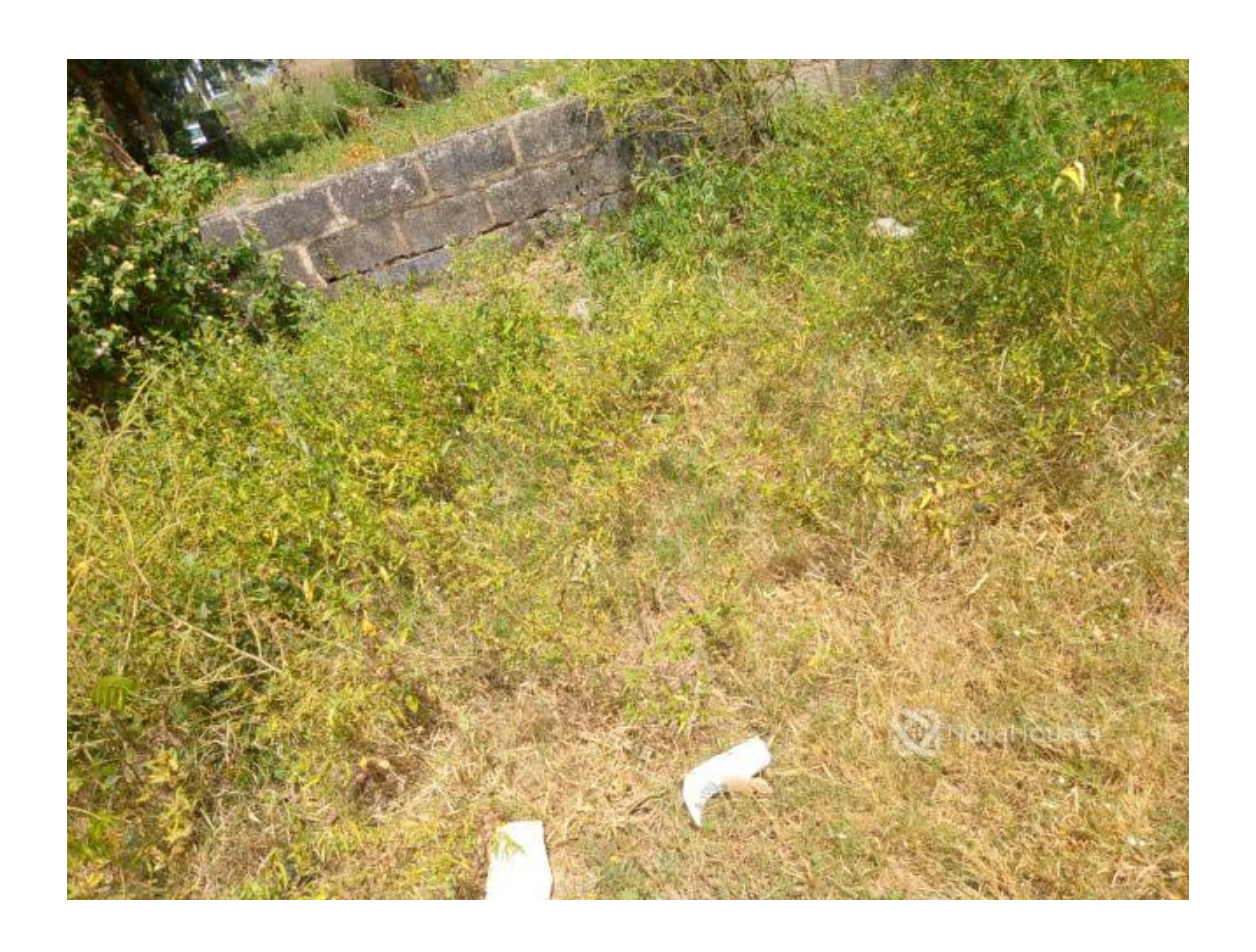
Jahi, Abuja, Abuja FCT NGN 60,000,000.00