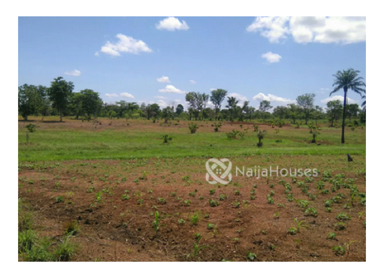
Gudu, Abuja, Abuja FCT NGN 1,300,000,000.00