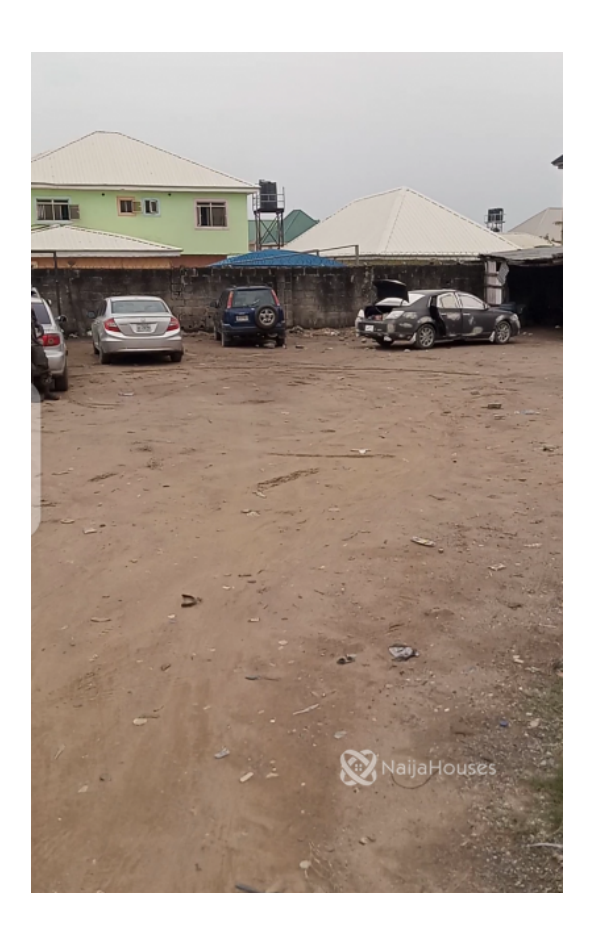
FHA Lugbe, Abuja, Abuja FCT NGN 35,000,000.00