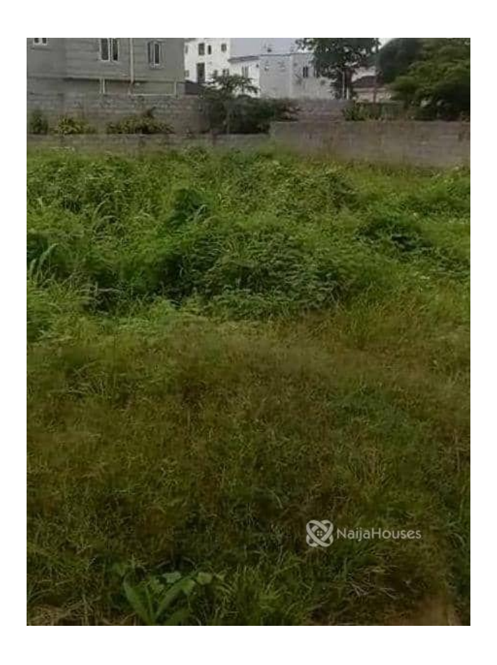
ekiwe street Jabi, Abuja, Abuja FCT NGN 500,000,000.00