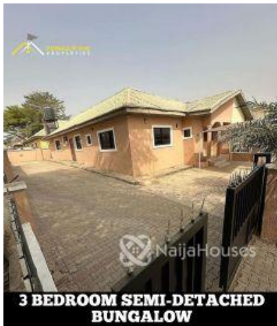
3 BEDROOM SEMI-DETACHED BUNGALOW N70m | *CITEC ESTATE, Abuja*