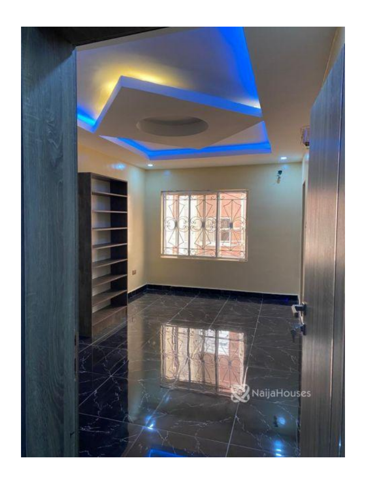
Before Godab Estate, Abuja, Abuja FCT NGN 45,000,000.00