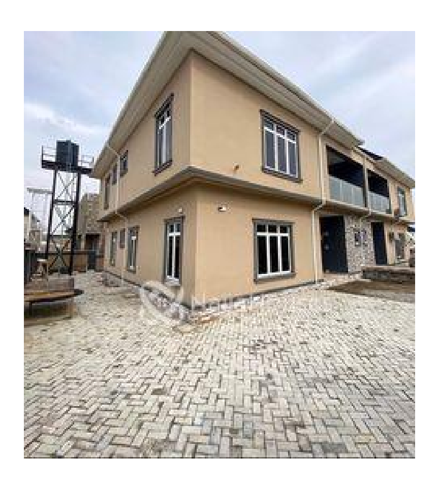
Apo Wumba, Apo, Abuja, Abuja FCT NGN 65,000,000.00