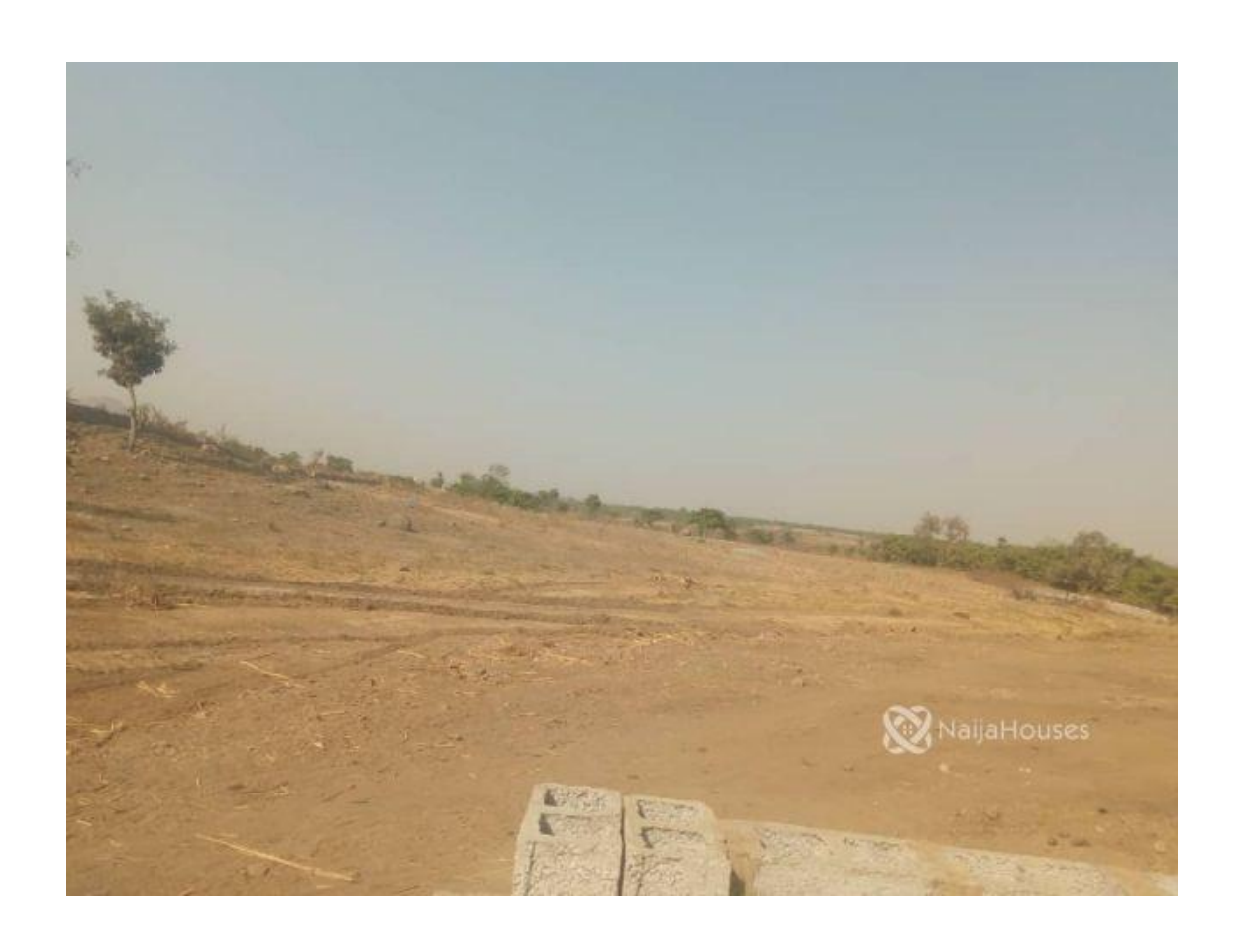
Along Trademore Estate, Close to Summit Estate , Abuja, Abuja FCT NGN 4,500,000.00