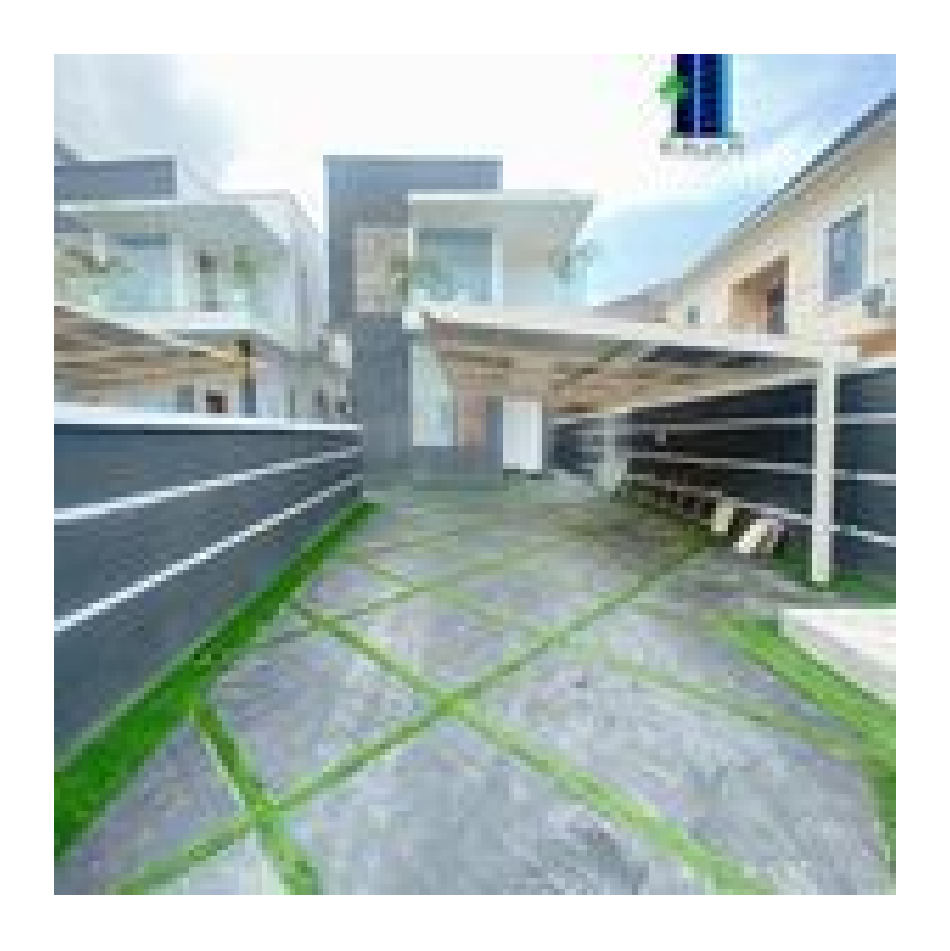
2nd Toll Gate ,Chevron ,Lekki ,Lagos, Lekki, Lekki, Lagos NGN 170,000,000.00